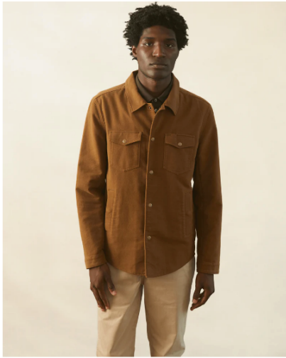
MOLESKIN MO SHIRT JACKET