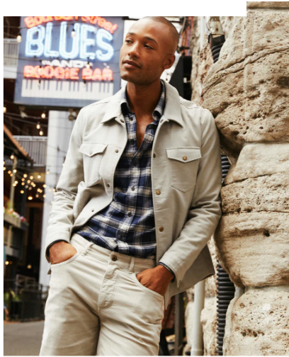
MOLESKIN MO SHIRT JACKET